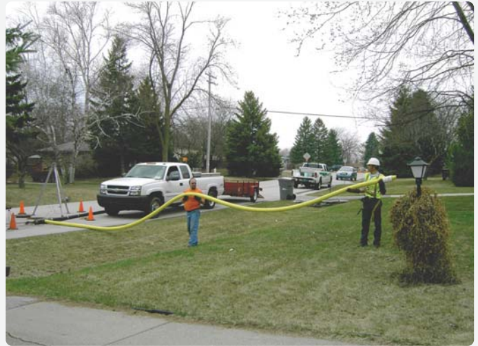
Lateral bladder extended out ready for lubrication.

The second phase of Brown Deer’s project is currently under way and is being done independently of Milwaukee Metropolitan Sewage District, which had provided the funding for the initial phase. The Village contracted with Great Lakes TV & Seal, Green Bay, Wisconsin, through the bidding process to re-televise the laterals that were done, as well as clean, test, and seal 22 additional laterals in the same subdivision.