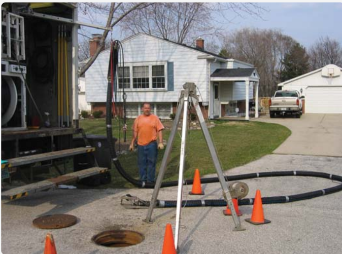
Great Lakes TV & Seal’s Greg Healy stands beside the packer just brought out of the sewer with help from the bumper crane.

The cleaning of the laterals took approximately two days. Now Healy and his crew could begin sealing the laterals using Logiball’s 38-foot lateral bladder with Avanti International’s AV-100 chemical grout. Testing and sealing laterals from this distance creates a series of unknowns. One that concerned Ancil was the speed at which the grout would be pumped before it would gel.