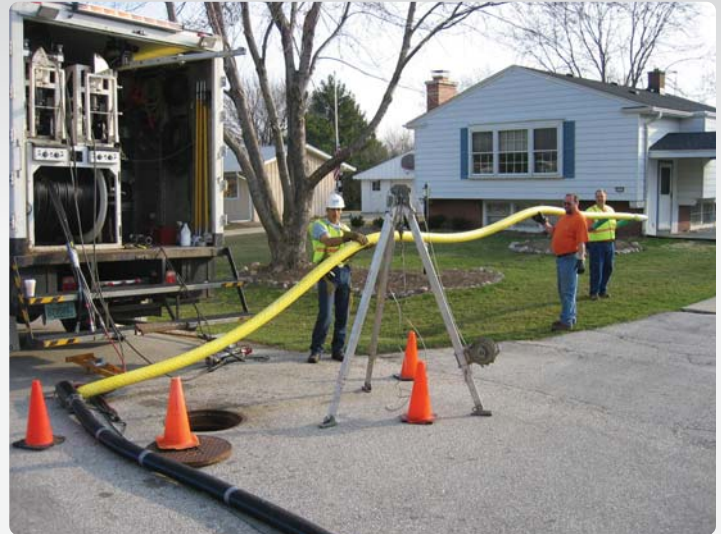
The 38-ft long Logiball Packer.

Before concentrating on testing and sealing the laterals, the most pressing problem was figuring out how to clean the laterals first to ensure a smooth ride for the lateral packers that would follow to do the grouting.