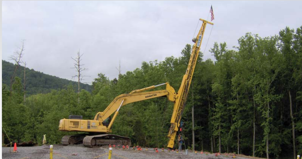
The sleeve pipe driver is a 42-foot mast with a hydraulic hammer.

Polyethylene sheeting was placed over the top of the crushed stone and the trench was backfilled with soil. The water table was determined to be about 25 feet below the bottom of the trench. Approximately 9.5 million gallons of contaminated liquid waste was then