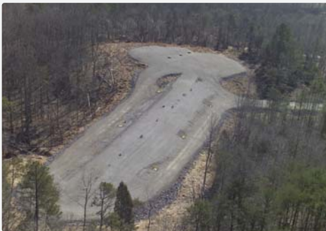
An aerial view of Trench 5

The current scope of work includes insitu-grouting of two trenches and seven wells, all of which were constructed or installed in the 1960s. The longest of the trenches, Trench 5, is approximately 300 feet long, 10 feet wide at the ground surface, and 4 feet wide at the bottom of the trench. This trench was 15 feet deep and was layered with 1.5" to 2" diameter of crushed stone to a depth of approximately 10 feet.